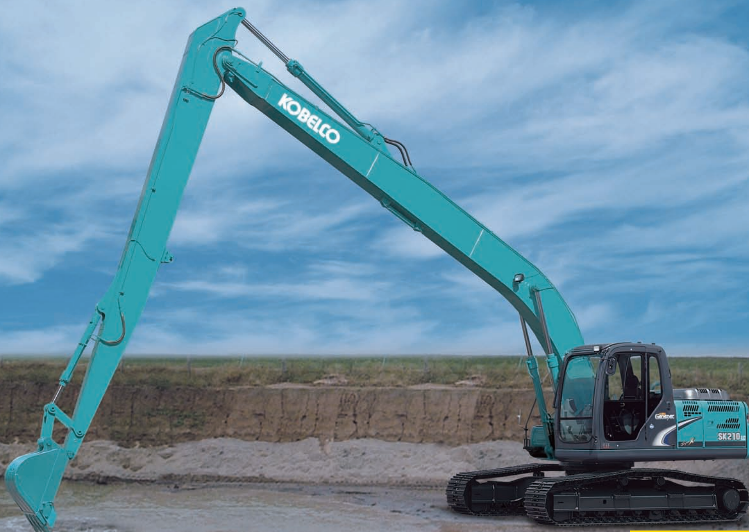
Photo shows composite image. Actual machine may differ in some details.

Max. Working Radius: 18,530 mm Digging Depth: 14,730 mm